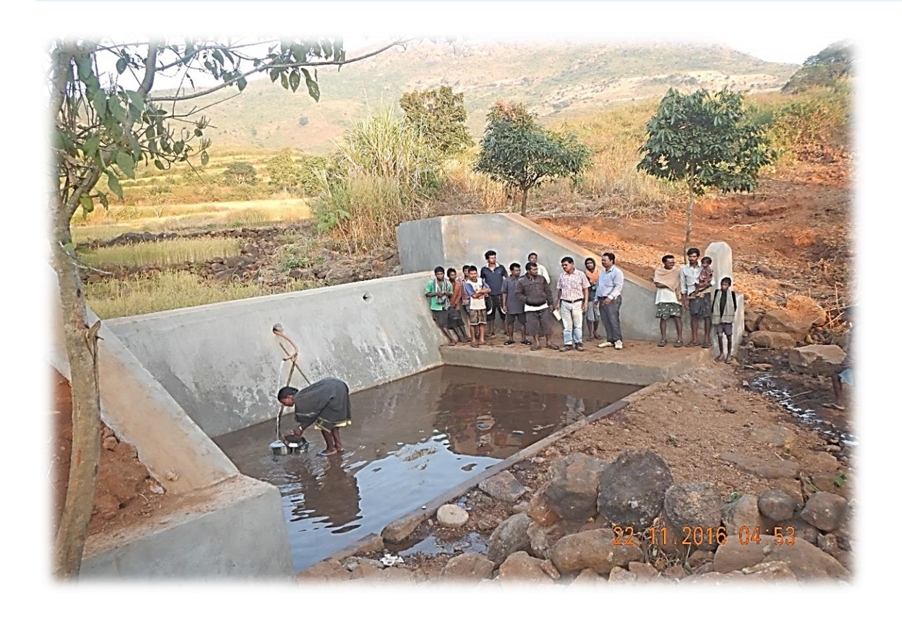
DIVERSION WEIR & FIELD CHANNEL AT POTTANGI EXECUTED BY WATERSHED