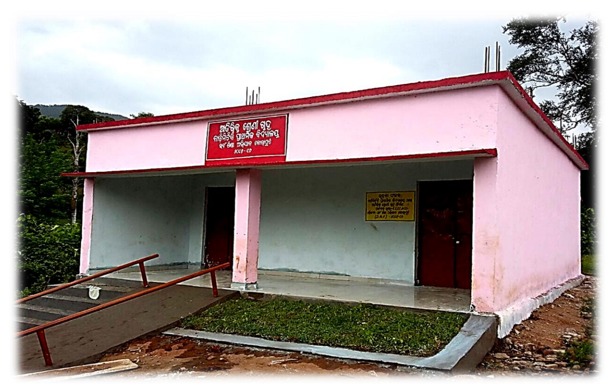
ADDITIONAL CLASSROOM AT NADIMITIKI PS NARAYANPATNA BY SSA