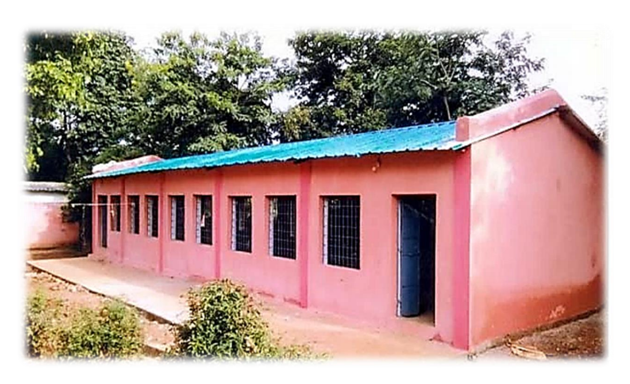
KITCHEN CUM DINING, DRAIN AT PRADHANIPUT SEVA SHRAM AT KUNDRA BY PA ITDA JEYPORE