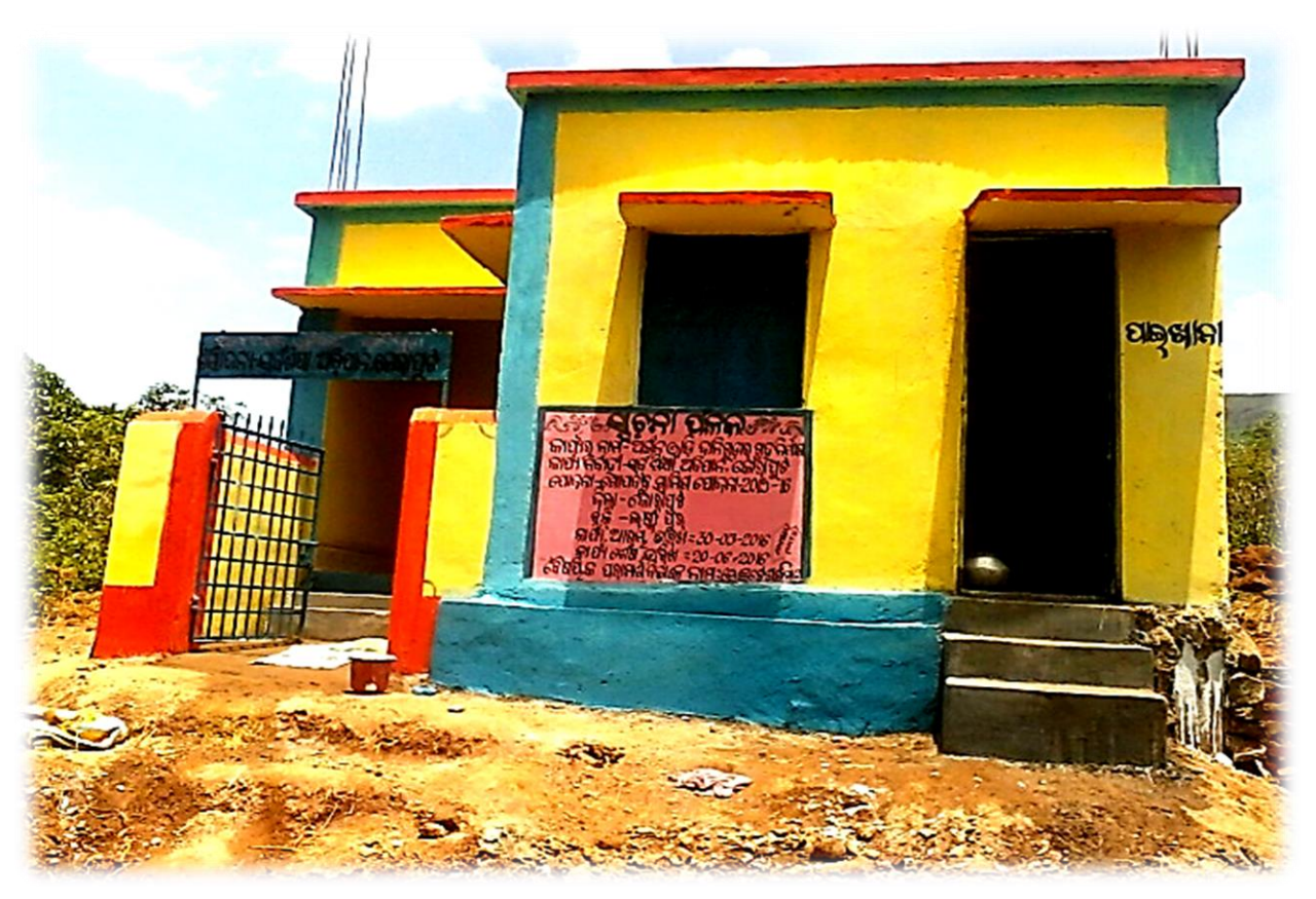
ANGANWADI CENTRE AT JANIGUDA OF BHITARAGADA & LAXMIPUR BY SSA