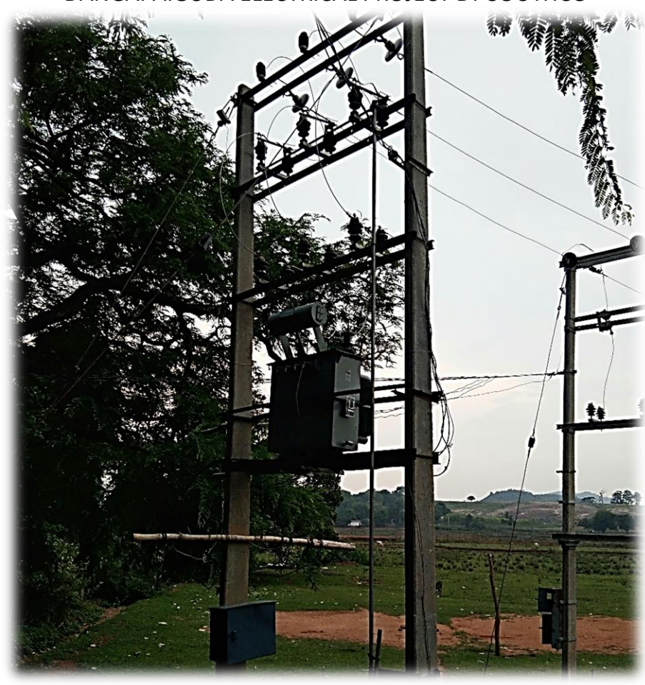
KUMARGUDA TRANSFORMER UPGRADATION WITH NEW POLE