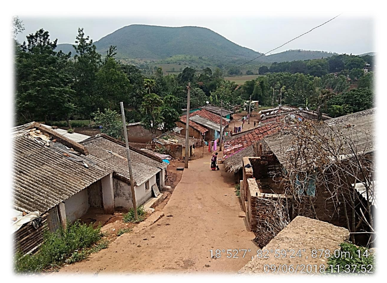
DANGAPAIGUDA ELECTRICAL PROJECT BY SOUTHCO