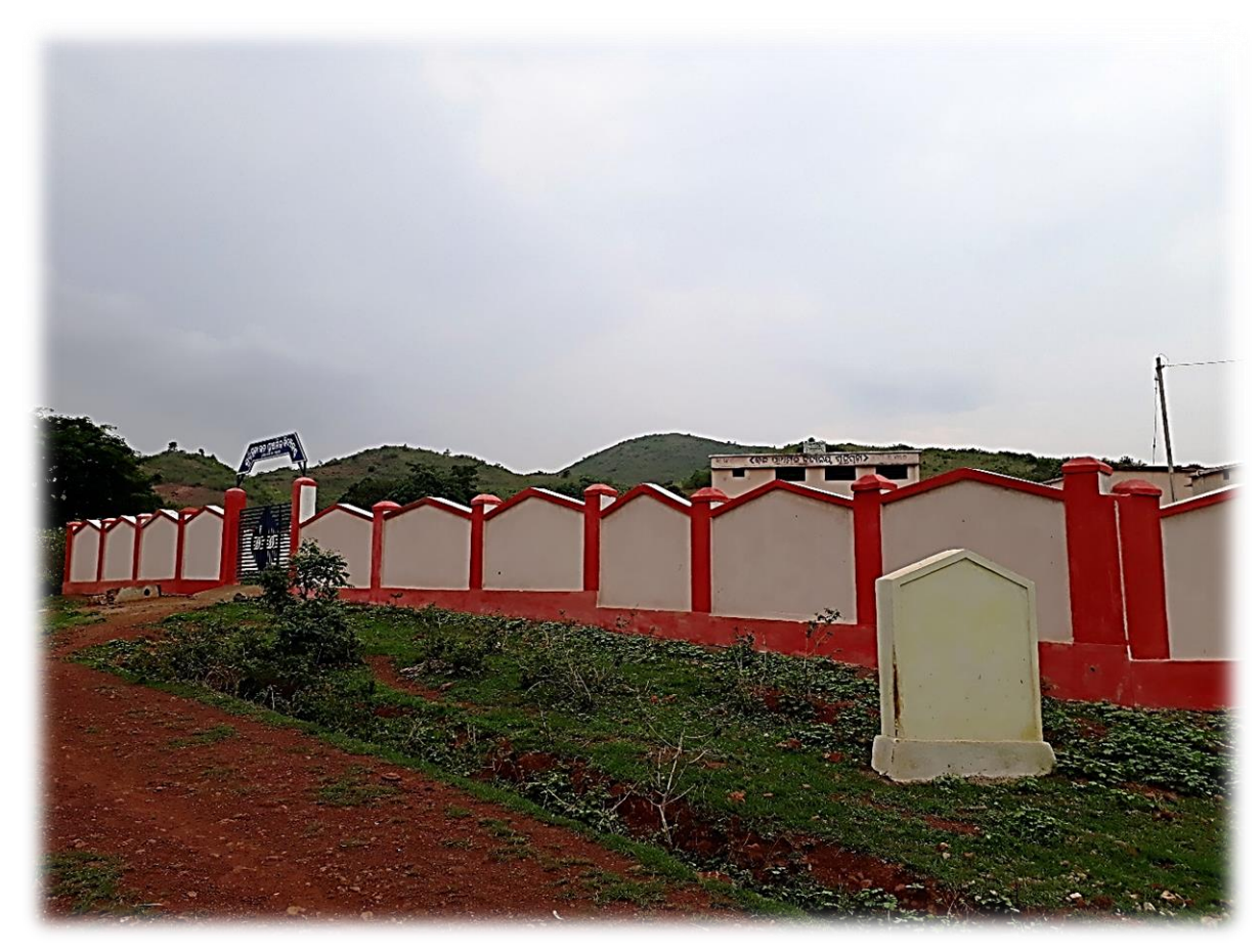
BOUNDARY WALL AT SUKRIGUDA UPPER PRIMARY SCHOOL OF DASMANTPUR BY SSA